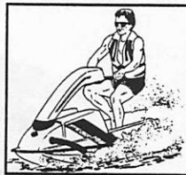
JET SKIS: SLOWED DOWN BY CITY COUNCIL AND MARINE PATROL

Since the City of Virginia Beach Council mandated how jet skis were to be used on the city's waterways, Chesapeake Bay and the Atlantic Ocean, reckless behavior and a diminished noise level have been observed on the water. The safety of beach-goers and boaters has been restored. The Council must be applauded for its rapid enactment of new laws. The Virginia Beach Police Marine Patrol operates with five boats. The police work three jet skis out of Lynnhaven Inlet. These efforts ultimately protect our beaches. Fewer violations by jet ski users have been recorded this summer. The strict implementation and enforcement of the laws by the Marine Patrol must be commended.