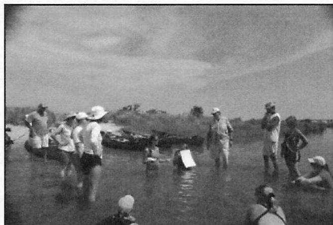
Educator training—Chesapeake Bay Foundation

“I am immensely proud that this program teaches students that they can make a difference in Virginia’s environment.” —Laurie Sorabella