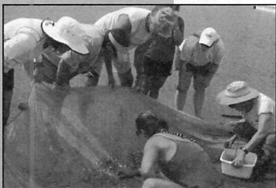
Educator training—Chesapeake Bay Foundation

Between September 25 and 27, 175 school teachers received “spat” or baby oysters, to raise with their students throughout the school year.