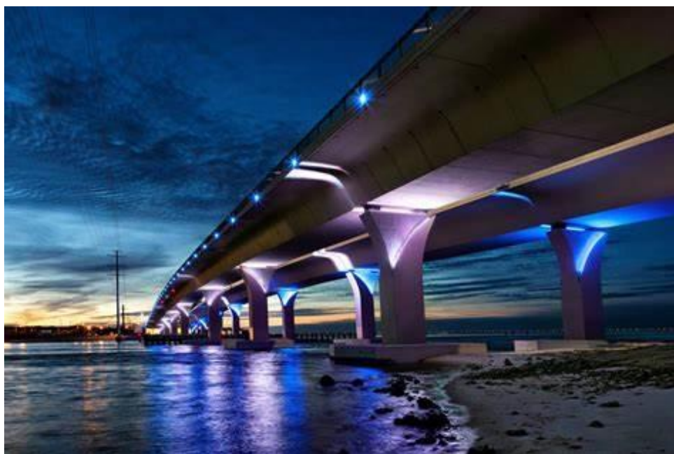
Lesner Bridge

Newsletter of the Virginia Beach Bayfront Advisory Commission