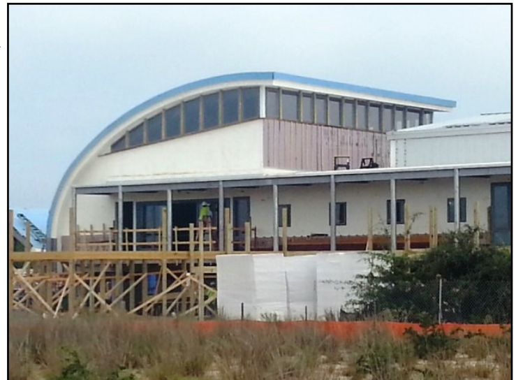
—Christy Everett, CBF

The Trust for Public Land purchased the property for $13 million. The city then acquired 108 acres from The Trust for $12 million using federal and state funds, loans and city and corporate funds. CBF purchased the remaining 10 acres of the property for $1 million.