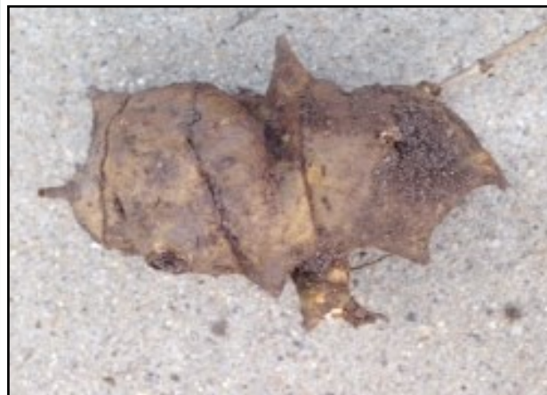
Underground rhizome of Greenbrier plant

Edible portions of the plant include the fruit, root and stem. Extracts from the roots of some Smilax species, such as Jamaican Sarsaparilla ( S. regelii ) is used to make the sarsaparilla drink. Naturalists eat young shoots raw or cooked (they taste like asparagus) as well as the berries raw or cooked. Traditional use of the roots in soups and stews. American settlers mixed a powder made from the roots of native Smilax with molasses, herbs and corn, brewing a home-made root beer. Grinding the root to powder creates a pectin-like gelatin. Native peoples used the leaves in tea form to treat rheumatism and stomach problems, and the wilted leaves as a poultice for boils and ulcers. They used the vines to weave into baskets, and the leaves to wrap tobacco or other herbs for smoking.