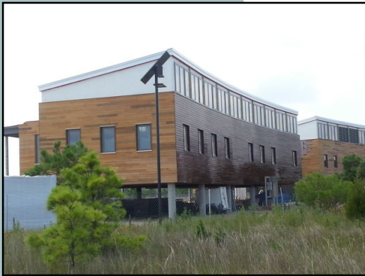
—Christy Everett, CBF

Progress continues on the Chesapeake Bay Foundation’s Brock Environmental Center, the state-of-the-art green, environmental center under construction at Pleasure House Point.