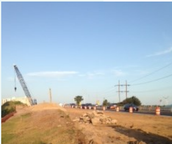
New eastbound bridge lane construction — Jill Doczi

Traffic patterns on Shore Drive have changed as you approach the Lesner Bridge. Work over the next few weeks will consist of preparing both the eastbound and westbound bridge approaches for the lane shifts as Stage Two construction of the bridge begins.