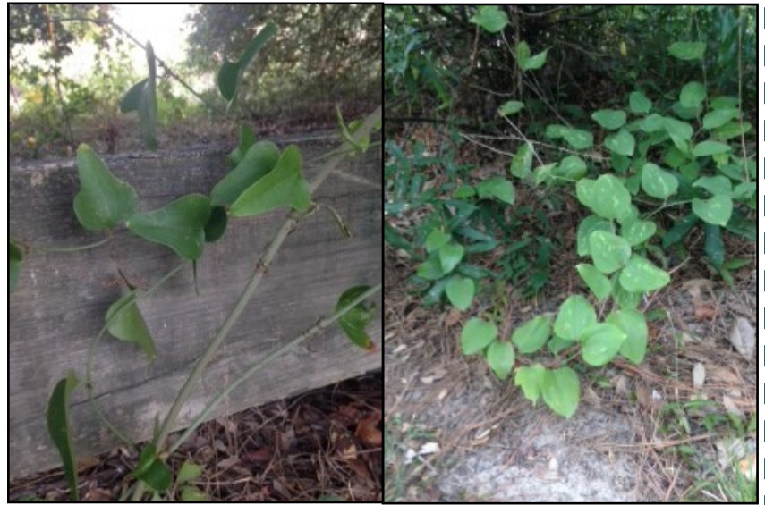
Smilax bona-nox — Jill Doczi

Animals and birds eat the berries, which pass through their digestive tracts and reemerge in the droppings to reproduce the plant. The plant's other method of propagation is through rhizomes, making it very damage-tolerant. Because of this, the species can become invasive and difficult to control. Digging deeply, following the root up to a foot to find the rhizome remains the best method of chemical-free eradication.