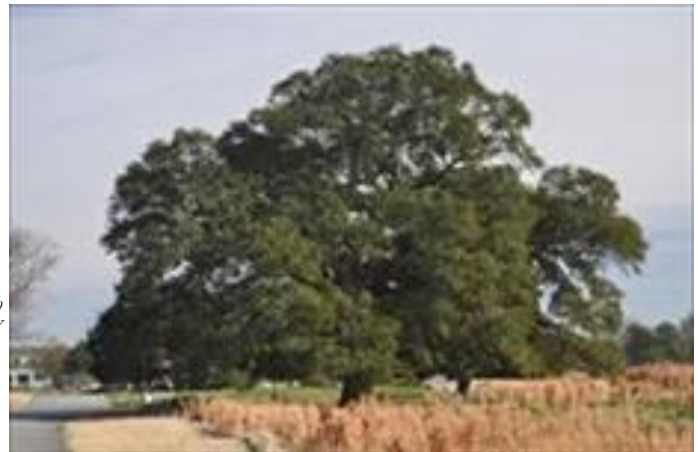
—Lynnhaven River NOW

60-100’ height/25-35’ spread .5-1’ shipped