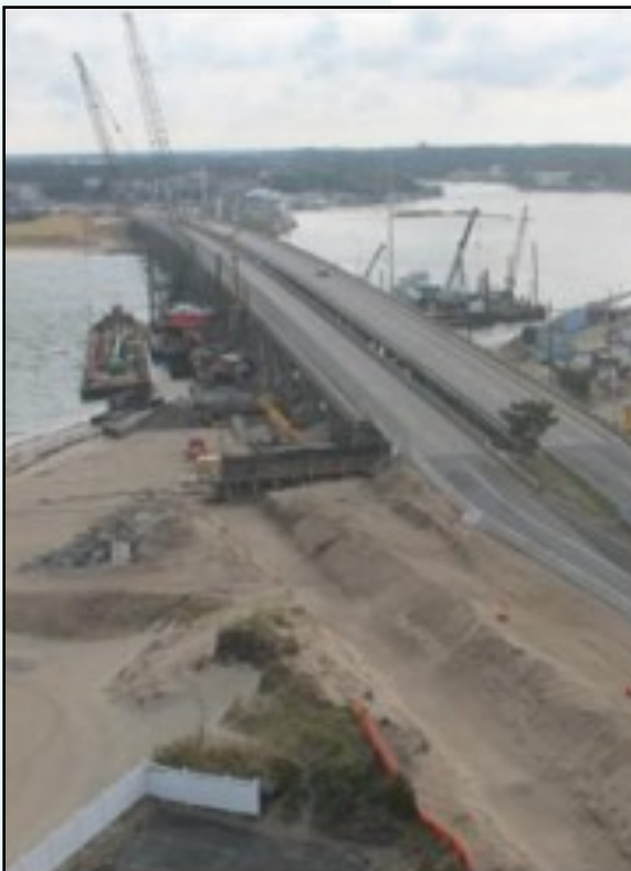
New eastbound bridge lane construction — Jill Doczi

The electrical contractor completed the boring of the new electrical conduit beneath East Stratford Road from Sushi Coast to J & A Racing on October 20 and repaired potholes on October 21.