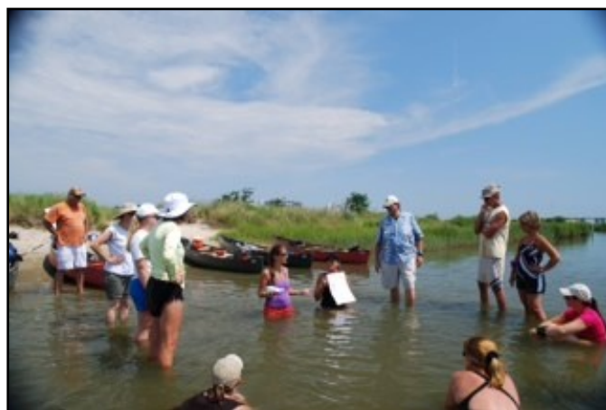
Educator training—Chesapeake Bay Foundation

The “Schools Restoring Oysters to the Chesapeake” program serves the dual function of providing the students with an exciting hands-on learning opportunity, while also involving them in a powerful environmental stewardship activity that tangibly helps to restore oysters to the Lynnhaven.