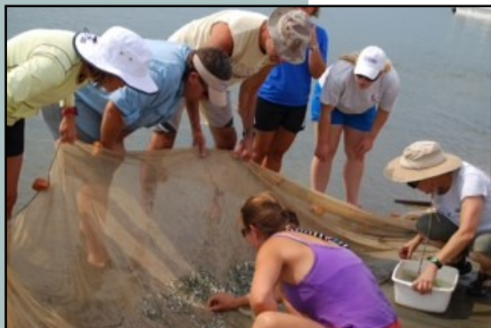
Educator training—Chesapeake Bay Foundation

Between September 25 and 27, 175 school teachers received “spat” or baby oysters, to raise with their students throughout the school year.