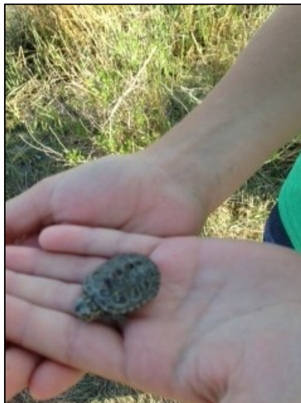
Baby terrapin found on washed up on our bay beach and

Chesapeake colonists and Virginia natives ate terrapin roasted whole in live coals.