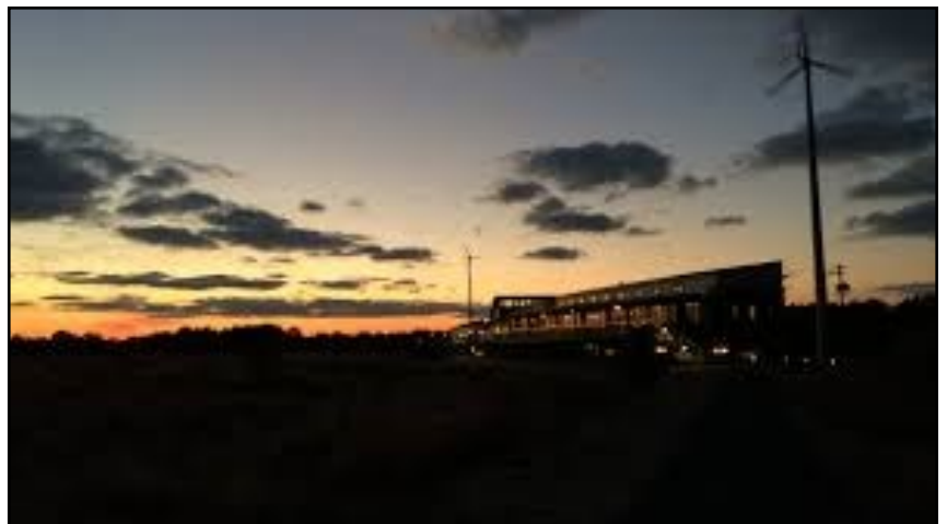
Brock Environmental Center—SDCC site.

Thursday, 7:30 p.m. All neighbors welcome. This is a great time to renew or join.